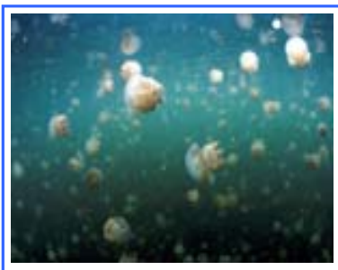
Jelly Fish Lake

Check with our travel department for detailed information regarding the accommodations and flights.