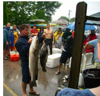
Contestant with 32-35 lb striper and 8lb Tautog

At least 8 large stripers were caught with the average weight totaling 32 lbs. The overall winner was determined by the largest number of species caught, in this case, seven different species of fish. After reaching maximum size limits; e.g. 20lb. for stripers, there was no point advantage for fish that exceeded upper limits in size. I have never seen anything like it.